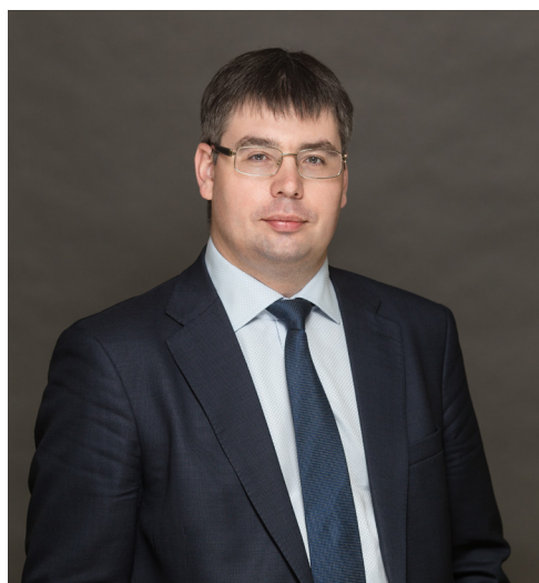
General Director, Chairman of the Management Board